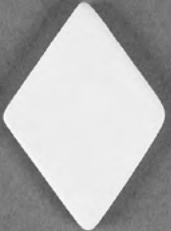
33441 Diamond Embellie 1.75" x 1.15" x .15" 12 per case