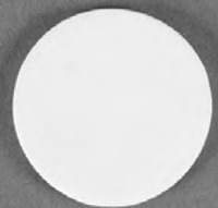
33444 Circle Embellie 1.45" x 1.45" x .15" 12 per case