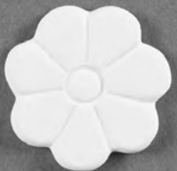
33443 Flower Embellie 1.25" x 1.25" x .15" 12 per case