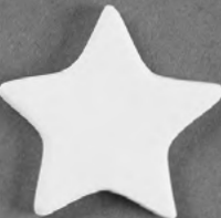
33445 Star Embellie 1.5" x 1.5" x .15" 12 per case