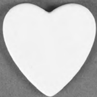
33442 Heart Embellie 1.45" x 1.5" x .15" 12 per case